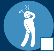
Fever of 100.4°F or above

1. In the past 24 hours, have you had one of the following symptoms unrelated to a pre-existing medical condition: frequent cough or shortness of breath?