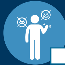
New Loss of Taste or Smell