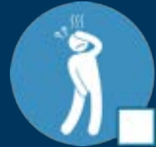
Температура 100.4°F и выше