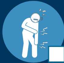
Боли в мышцах