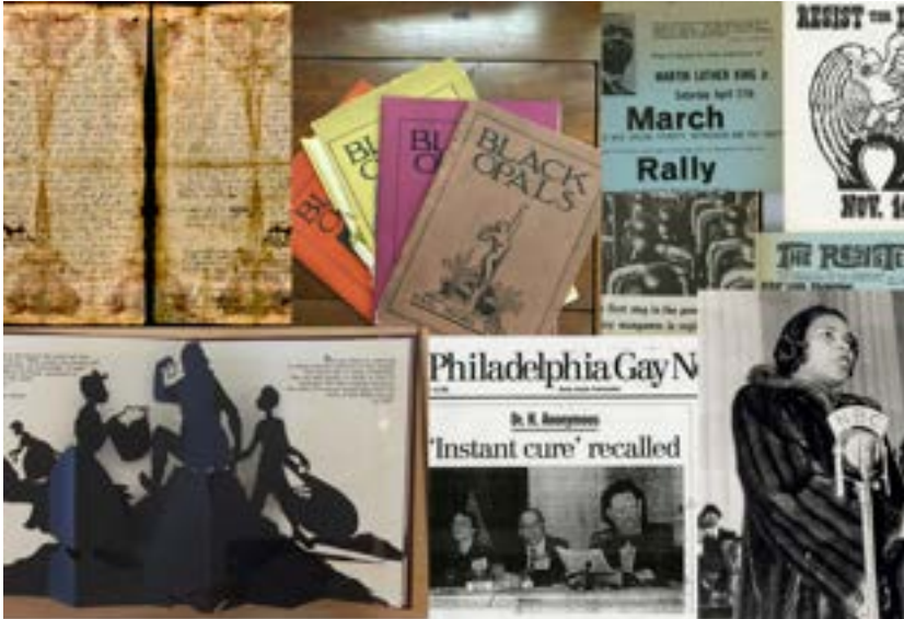
Archival documents from Chronicling Resistance, Enabling Resistance , Philadelphia Area Consortium of Special Collections Libraries, 2018.