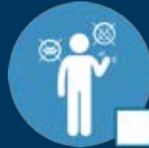
Потеря обоняния и вкуса