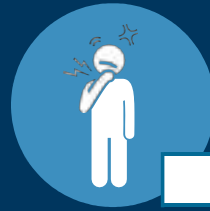
Боль в горле