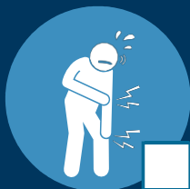
Боли в мышцах