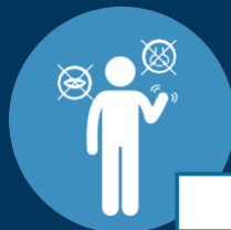
Потеря обоняния и вкуса