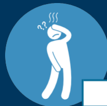
Температура 100.4°F и выше