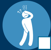
Fever of 100.4°F or above