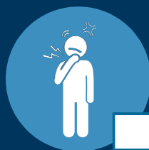
Боль в горле