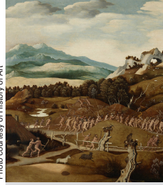
Conquest of America Landscape, Mostaert. See Jan Mostaert: Tradition and Invention in Sixteenth-Century Haarlem on November 2 in Talks.