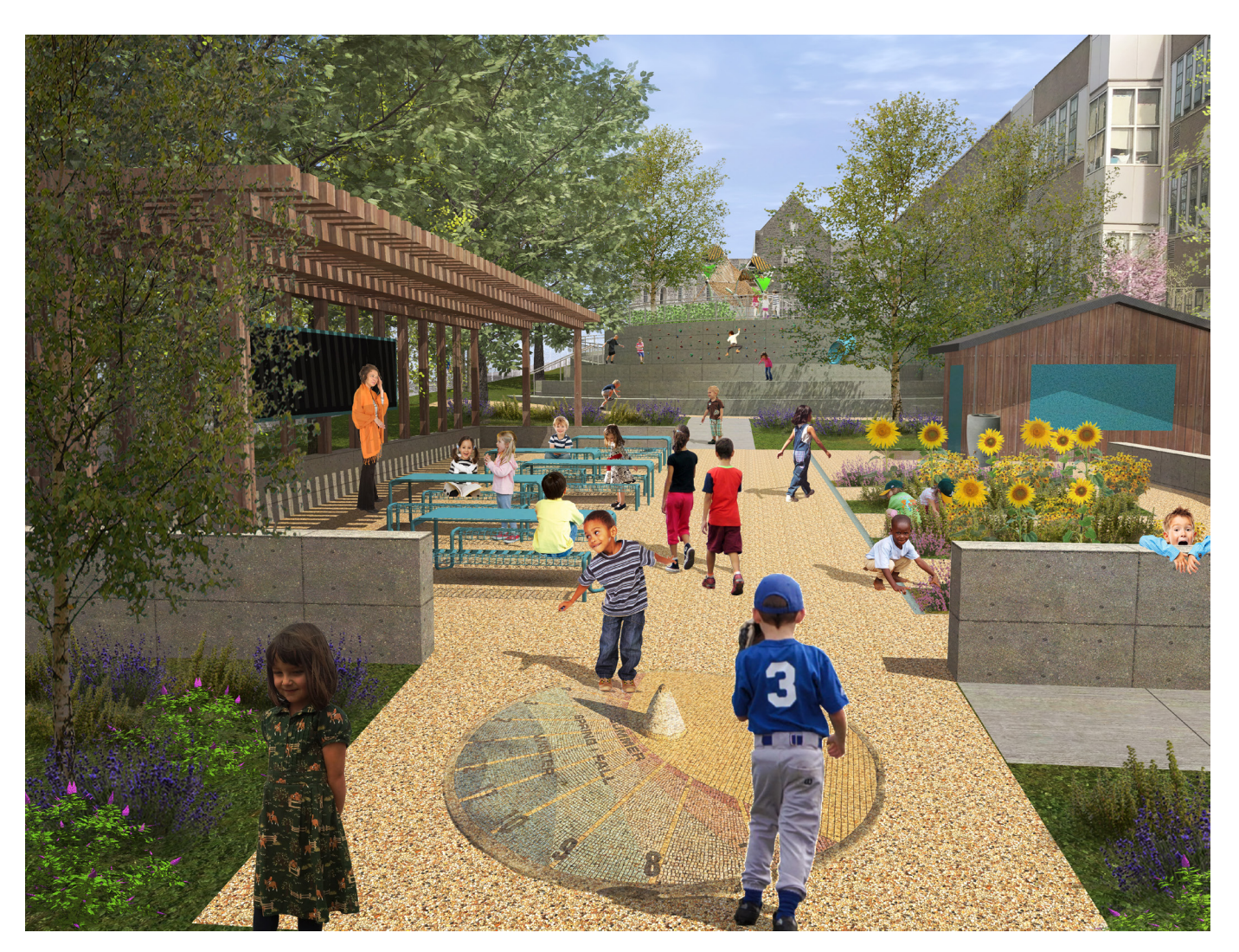
The outdoor classroom becomes a more formal space that includes storage shed, water cistern, test garden beds, tables, writing board, and tables. This is an ideal place for habitat learning elements like sundial, compass rose, bird house, and weather station.